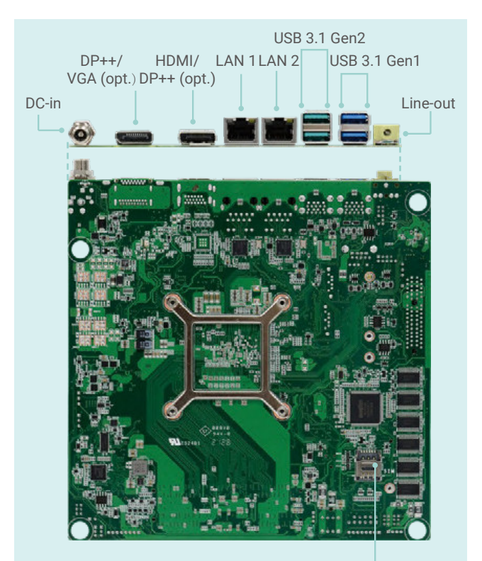
Nano SIM Socket (connected to M.2 B key)

The main reason why DFI was finally selected among many competitors is not only because of its excellent product quality, but also because of its mission-oriented customer service. As early as November 2020, DFI quickly sent samples and fully responded to customer needs. Due to the demand for three additional video outputs, DFI customized for this by modifiying to two internal eDP and one