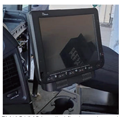
FM10Q VMC installed firmly on the truck