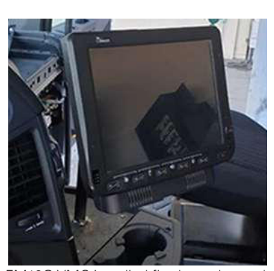
FM10Q VMC installed firmly on the truck