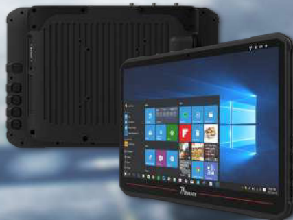
FM14E-V 14" VEHICLE MOUNTED COMPUTER