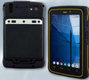
E430RQ8 4.3" RUGGED HANDHELD PDA