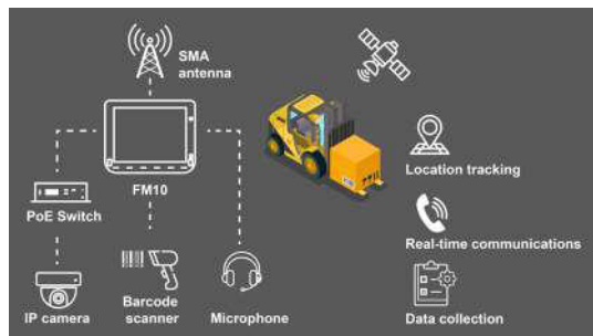
Application Diagram: Forklift Automation