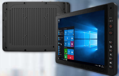
FM12AD-V 12.1" VEHICLE MOUNTED COMPUTER