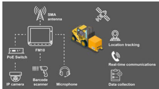
Application Diagram: Forklift Automation