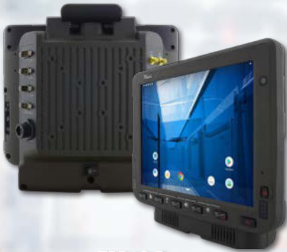
FM10Q 10.4" VEHICLE MOUNTED COMPUTER