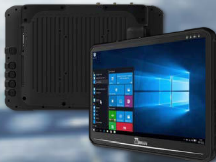
FM14E-V 14" VEHICLE MOUNTED COMPUTER