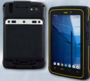
E430RQ8 4.3" RUGGED HANDHELD PDA