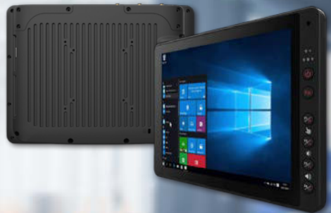
FM12AD-V 12.1" VEHICLE MOUNTED COMPUTER