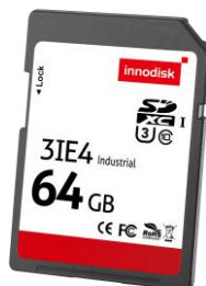
Figure 1: Innodisk Industrial SD 3IE4